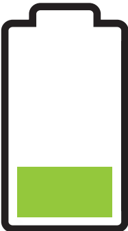
OTHER VSC COVERAGE

Not all VSCs cover the primary battery equally. Fully Charged has the highest levels of battery coverage in the industry today. This reduces the chances of your repair exceeding the value of your coverage and helps prevent out of pocket expenses.